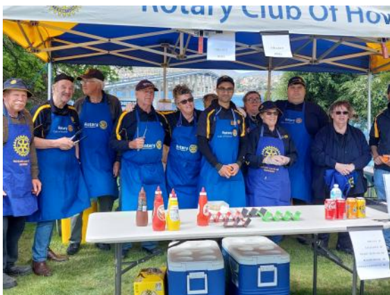
The BBQ team all ready for action at

Once again a huge thank you to everyone who contributed to this event – your hard work and generosity continue to make a difference in our community! A “Thank You” event hosted by Her Excellency at Government House is being organised. Stay tuned for details.